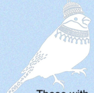
Those with strained father relationships