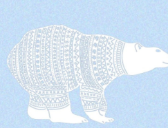
Fathers who have lost children