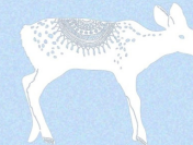
Those who have chosen not to be fathers